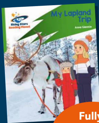
Fully-decodable reading books

Within the programme, there are lots of beautifully created and engaging resources such as flashcards, sound mats, and online, interactive Big Books and quizzes to develop learning further. There is also a fully matched series of decodable reading books from a variety of genres, which will be used in class as well as sent home for home reading. These books can also be accessed on the online platform to read as eBooks. If your school has a subscription to Rocket Phonics Online, they can allocate the eBooks for home reading.