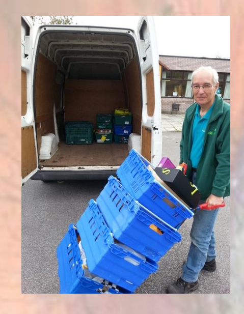
Parish Church News

This week the Wirral Foodbank collected all of the harvest produce collected from Dawpool, St Chad's and St Bartholomew's. They are very thankful for the donations and which amounted to 185.6 kilograms! Thank you to everyone for your generosity.