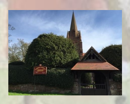
Sunday 21<sup>st</sup> October 9.30am Morning Worship

For Church information visit www.thurstaston.org.uk