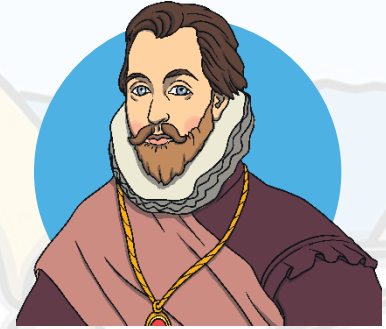
Sir Francis Drake

These explorers discovered and explored new lands around the world.