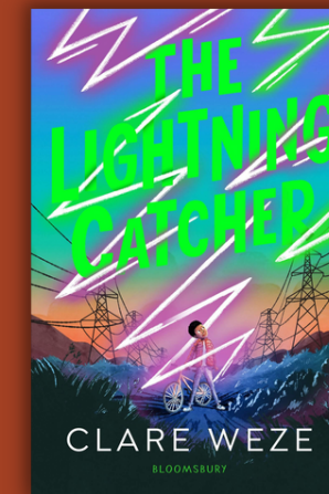
The Lightning Catcher by Clare Weze (Bloomsbury)