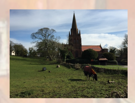
Parish Church News

For your donation please send in your Pudsey Bear picture with any coins taped to it on Friday 17 <sup>th</sup> November for them to be counted and the grand total revealed. Thank you for your support.